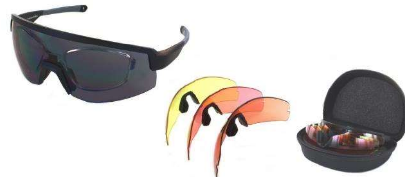
Fusion RX4 lens set