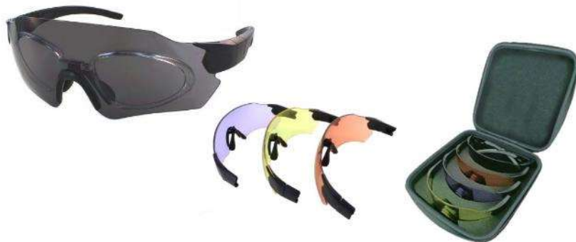
Connect X RX4 lens set