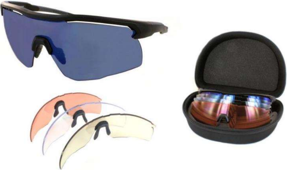
Aero 4 lens set