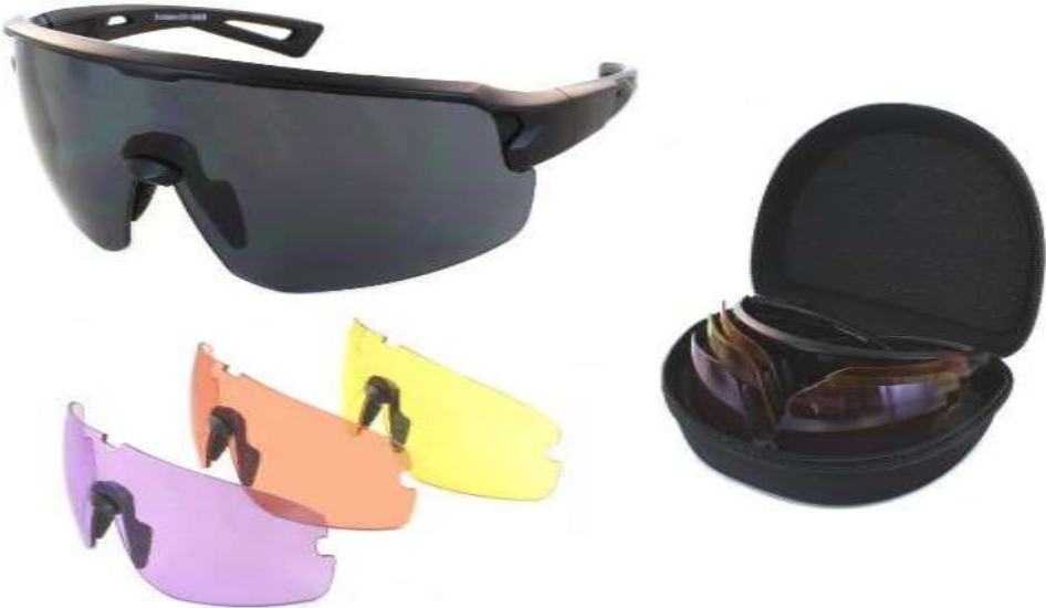
Velocity 4 lens set