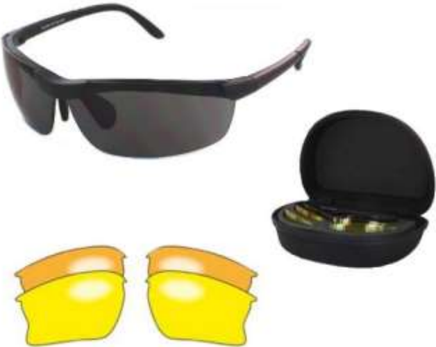
Crossfire 3 lens set