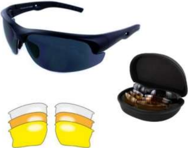
Strike 4 lens set