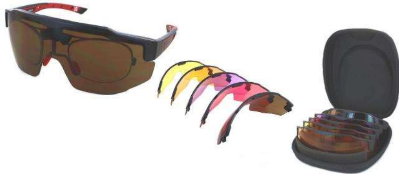
Connect X RX4 lens set